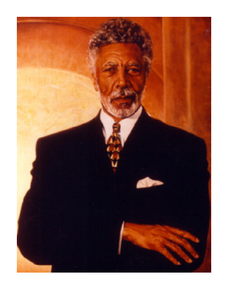
International & Area Studies University of California, Berkeley In association with Peace & Conflict Studies Presents

"Peace is More than the Absence of War" A free Public Lecture by